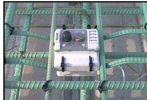
The ECI-1 During Installation in a Bridge Deck

The ECI-1 embeddable corrosion instrument packs 5 sensors into one small package that can be easily installed and placed wherever needed to provide adequate coverage of a structure